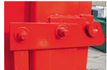
Optional ratchet-style rear door closing device secures the container.