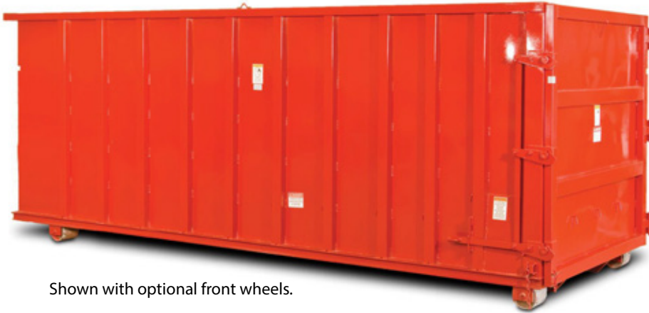
Shown with optional front wheels.

Sizes: 20, 30, or 40-cubic yards (other models available)