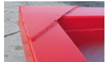
10 gauge front-to-side wall corner wraps provide added strength.

Construction and remodeling, landscaping, industrial, or residential clean-up. Extra heavy-duty models available for construction, demolition, and scrap metal applications.