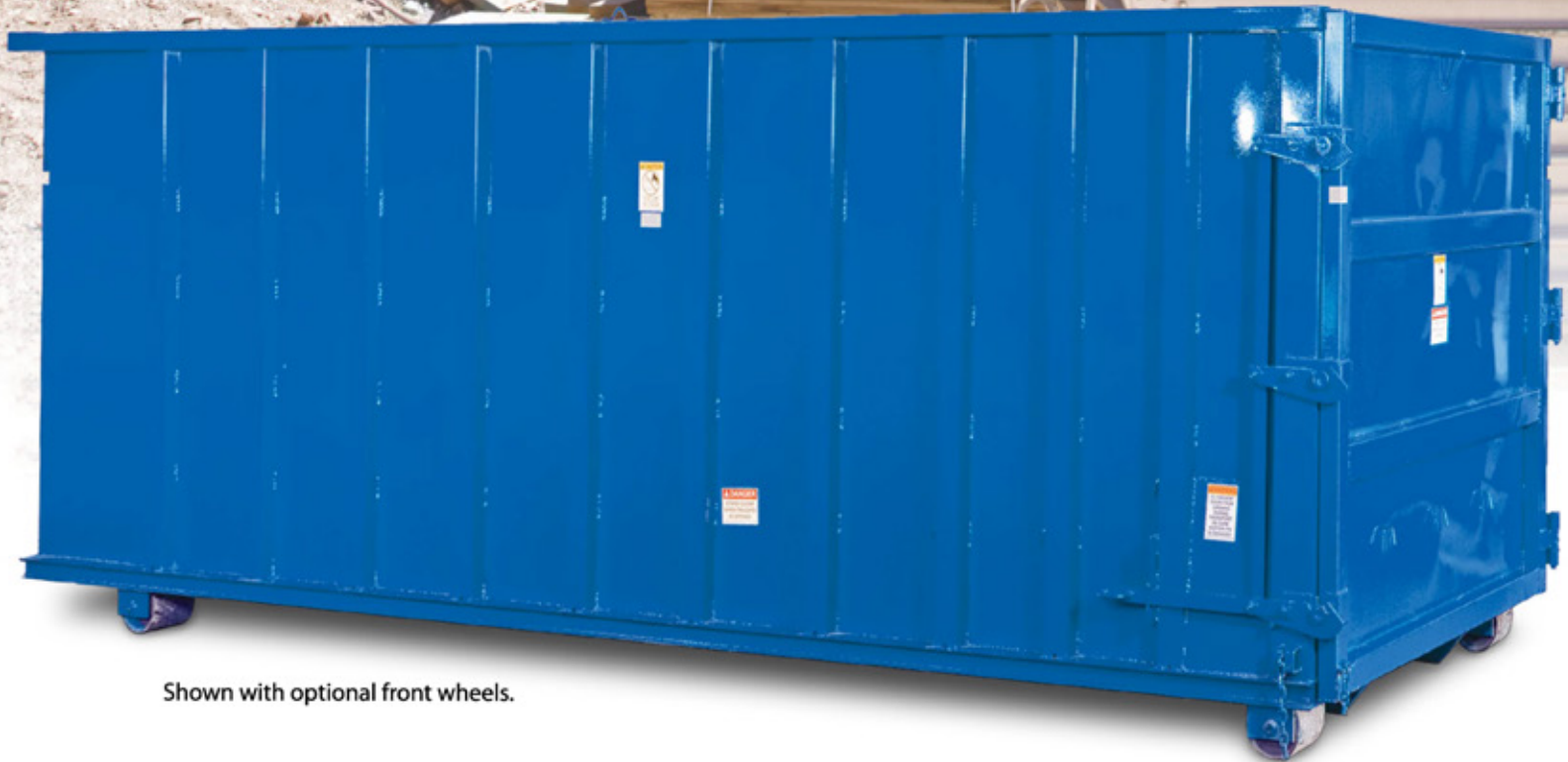
Shown with optional front wheels.